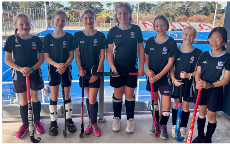
Go Hockey Starter pack - equipment